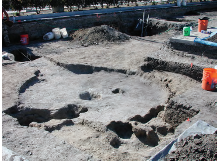
Figure 7. The archaeological remains of the native-style dwelling uncovered during archaeological excavations prior to the construction of SCU's Leavey School of Business.