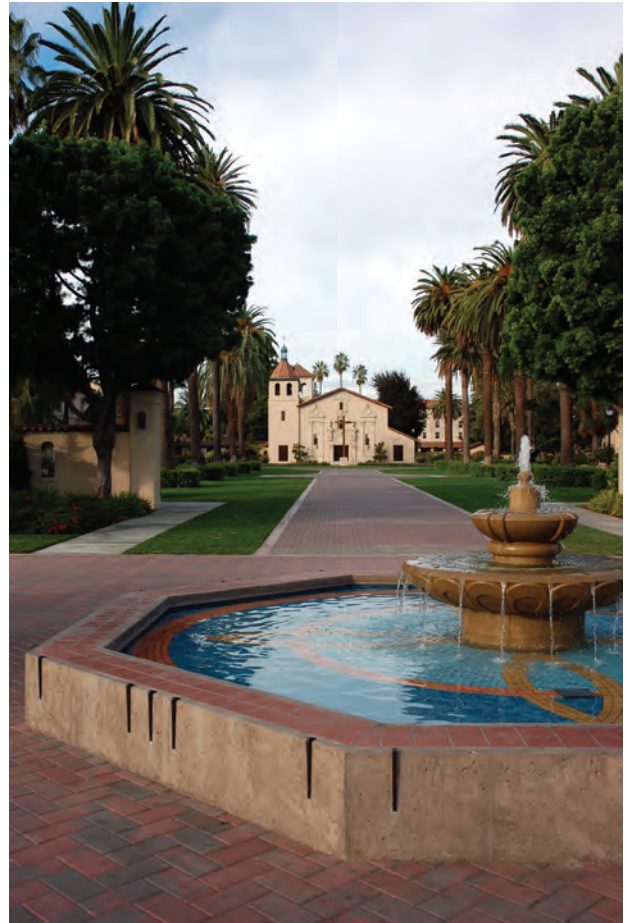
Figure 1. Reconstructed mission church on the campus of Santa Clara University.

Further changes to the fifth mission quadrangle took place in the early twentieth century with the demolition of the former padres’ residence and the fire of 1926 that consumed the mission church. The mission was rebuilt as a somewhat more ornate version of its 1825 incarnation, and the western wing of the quadrangle has also been restored to reflect its colonial-era appearance. These changes are well documented in Skowronek and Wizorek’s (1997) synthesis of Santa Clara archaeology, but additional portions of the fifth mission complex have been revealed since then. For example, small segments of foundations of the original 1820s quadrangle were noted in the lawn between the current church and the remaining portion of the west wing during trenching for a sewer project in 2010 (D’Oro et al. 2011). The stone foundations for the adobe church, as well as more recent American-period alterations, were also briefly uncovered in 2013 during the university’s campus beautification campaign. These