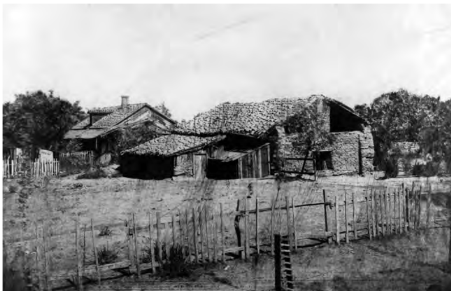
Figure 5. Remnants of adobe neophyte barracks, ca. 1868. The structure in the background houses the Santa Clara Woman's Club.

The fact that nearly all of the post-mission historical documentation and photographs focus on the Woman's Club Adobe suggests that it may have been the only such structure to have been left standing into the second half of the nineteenth century. Ranchería structures are completely missing from the Black survey of 1854, and by 1855, testimony given in a