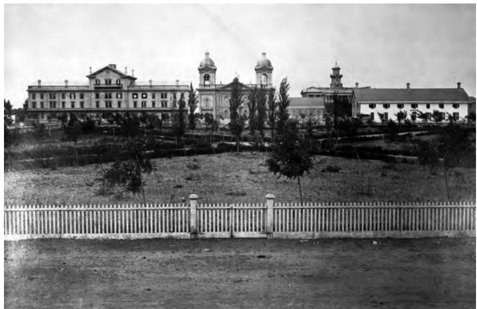
Figure 3. Santa Clara College, ca. 1865.